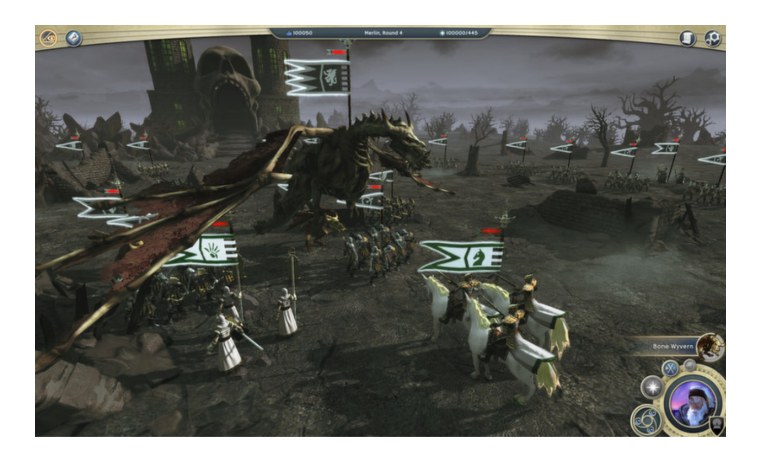
Age Of Wonders III - Deluxe Edition DLC Ativador Download [portable]

Download >>> <a href="http://bit.ly/2NGyOsm">http://bit.ly/2NGyOsm</a>